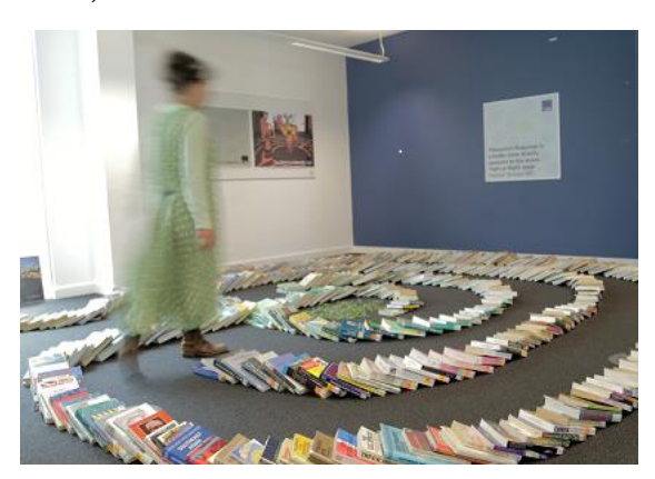
Figure 3: LJMUTLC16 labyrinth

... a single path leading to and from the centre. This releases the person walking from all decisions about direction and path and, as a result, has the potential to facilitate focused rather than scattered attention (p. 23).