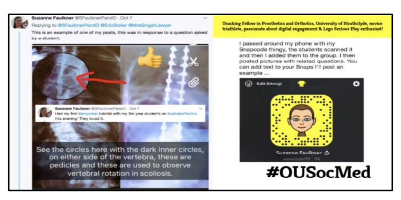
<u>Figure 2 Screenshot of presentation delivered by @EricStoller at the Open University Social Media</u> conference commenting on the innovative use of Snapchat in Higher Education.