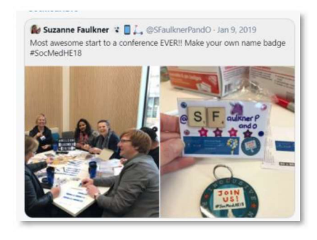
Exhibit C. An appropriated idea: Make your own conference badge

Building upon the success and appropriating all of @RKChallen's best ideas (please see Exhibit C) upon our return to a snowy Ormskirk we began planning #SocMedHE19 almost straight away. Not least because @RKChallen had set the bar very high!