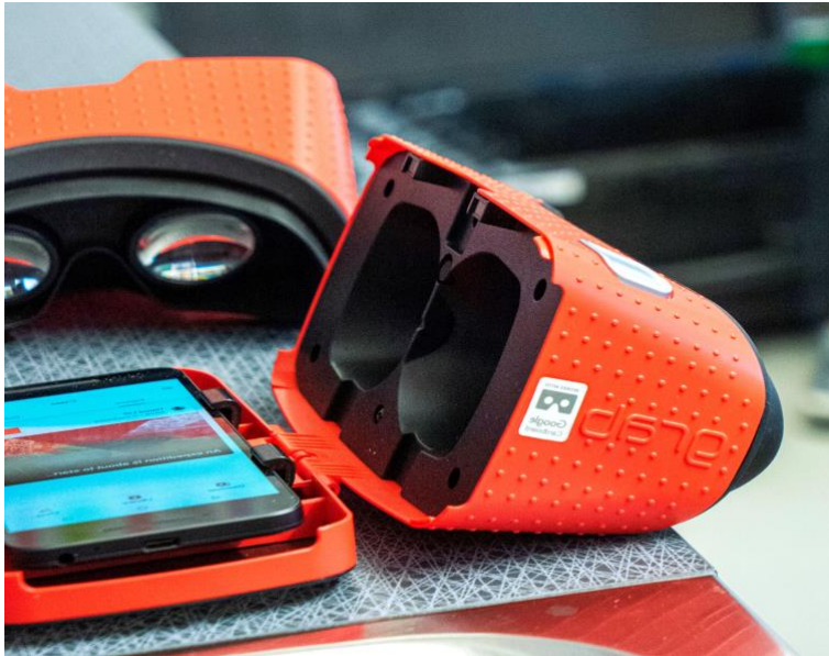
Picture 2. VR technology used in the classroom