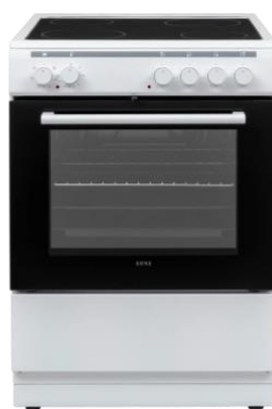
Picture 1. Images relating to the kitchen