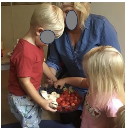
Photo 4. Children carry around and offer fruits from a bowl

Mm, yes, because I think, it is a little technology just to be able to carry around and offer the fruit in a bowl, so that you do not drop the fruit, something like that. It's a little unclear to me what to think about technology. (X5)