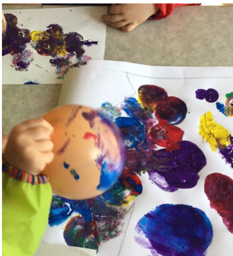
Photo 3. Children painting using balloons

Yes, but I think of this [pointing at the photo 3, with children using balloons as a tool when painting] with push and force depending on how hard you push, how big the imprint and technique of mixing colors and what happens then and what happens if I spin the balloon and so on. (X2)