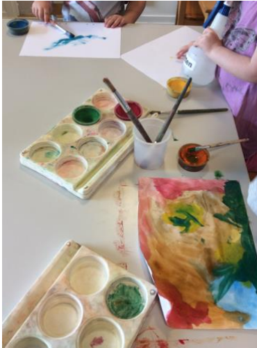
Photo 2. Children painting using brushes

Yes, but I think of this [pointing at the photo 3, with children using balloons as a tool when painting] with push and force depending on how hard you push, how big the imprint and technique of mixing colors and what happens then and what happens if I spin the balloon and so on. (X2)