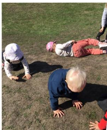
Photo 1. Children using their bodies to investigate the fastest way to scroll down a hill

This is us on the hill [pointing at the photo] and I had an idea that we can scroll down the hill and compare ... Do you have any special technique? Is it faster if you roll in some special way? How does it feel if you scroll things up the hill, ..., making a contrast? (X1)