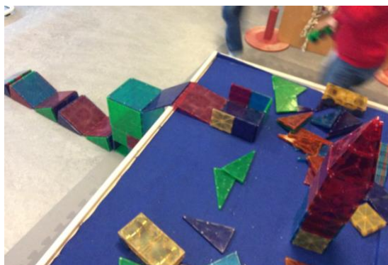
Photo 5. Children using magnetic building blocks to make constructions

you can develop it a lot, especially with these magnets [magnetic building blocks] in how they build oh ..., you can have a foundation on which it can stand and if it falls you can talk to the children about how to make it more stable and so on. So, there's a lot to work on with technology around this. (Z1)