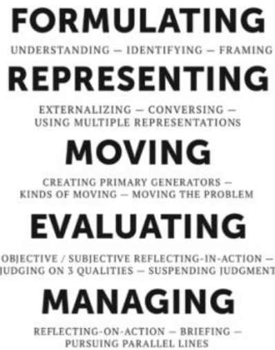
Figure 1. The spectrum of design activities (after Lawson and Dorst 2009).

The Design Thinking process of Stanford’s D School starts with ‘empathize’. Key literature has identified that this is a skill that needs to be nurtured to ensure people’s success and well being. The five steps of the D School’s Design Thinking process are: “Empathize → Design → Ideate → Prototype → Test”, while the five steps of the Design Thinking model promoted to educators by IDEO are: Discovery → Interpretation → Ideation → Experimentation → Evolution.