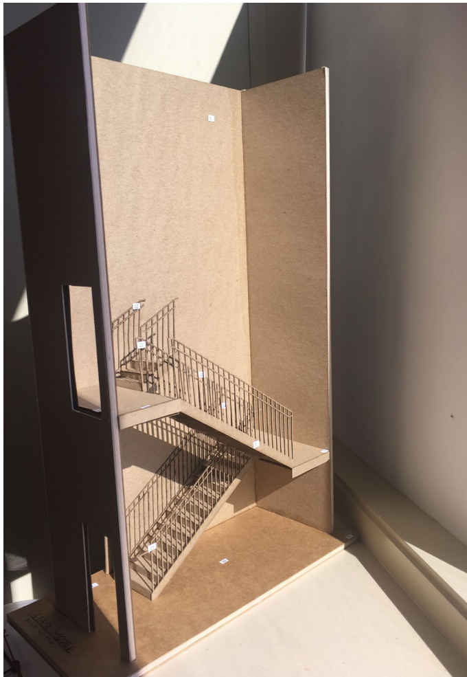
Figure 2: Stairs Model