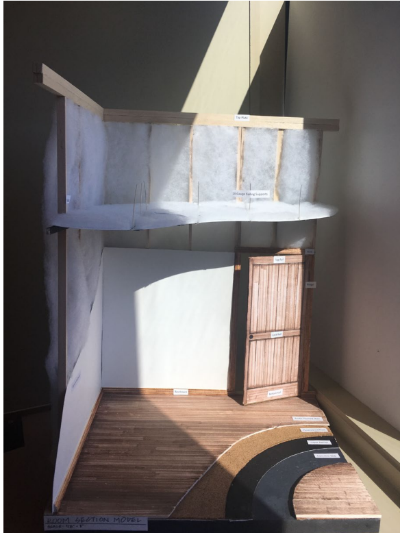
Figure 3: Room Section Model