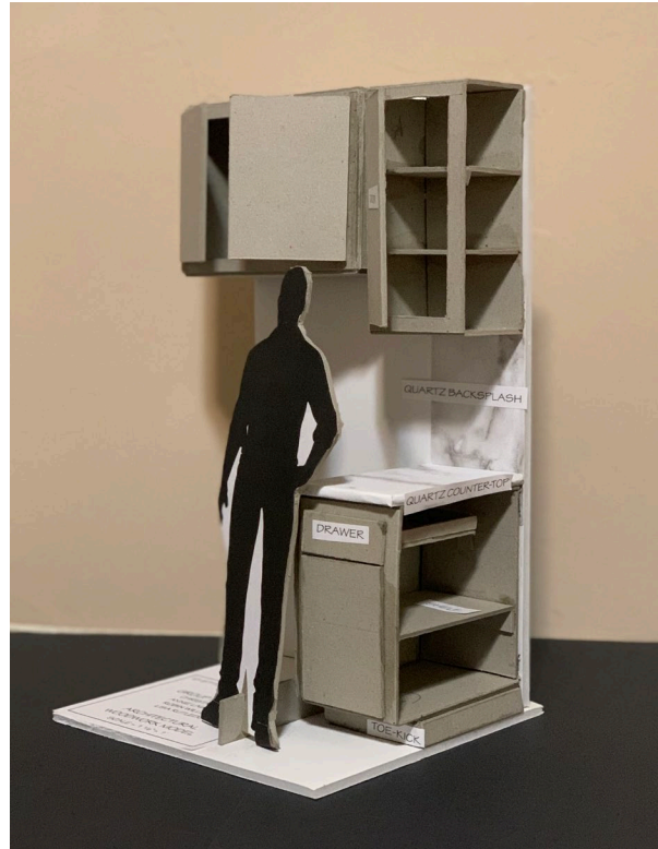
Figure 4: Kitchen Cabinet Model