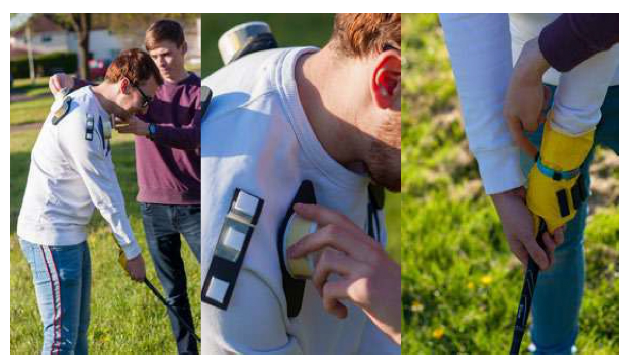
Figure 5. Later experience prototyping of iterated touch technology concept in context with a user.