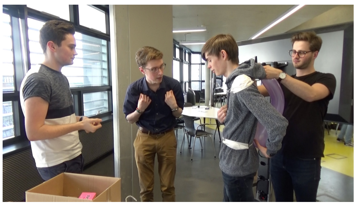
Figure 3. SDCA students experience prototyping.