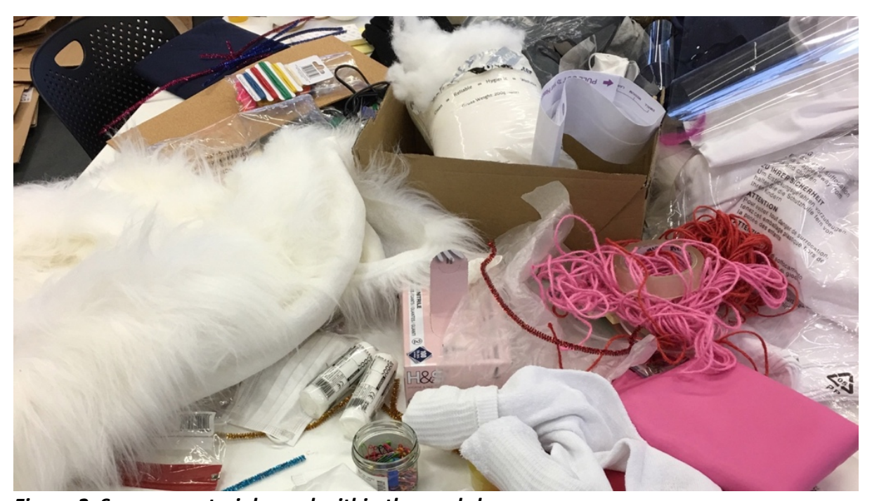
Figure 2. Sensory materials used within the workshop.

The materials were introduced to the ID students in the first of three workshops (see Fig. 2.), designed to support ideation of initial 'sketchy' concepts, before experience prototyping one or more of these concepts using the QPTR process. The premise was that at this divergent and creative stage of the UXD process (the 'Develop' stage of the Double Diamond) exposure to a wide variety of sensory materials would provoke the students to consider a broad range of touch-mediated communication experiences.