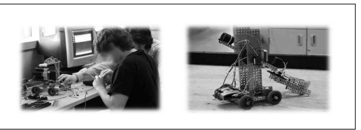
Figure 1. Activity and design artifact example in robotics design class

Architectural design students designed and built a miniature of a new library to be built in a small town with a population of 25,000. As in the robotic design project, the architectural design students were required to undertake this task as their final design project. The library was to be built on a square corner lot measuring 150' x 150,' needed to include various facilities such as meeting rooms, performance space, a computer access area, an outside garden or reflection area with benches, a circulation desk, a staff office or break space, and