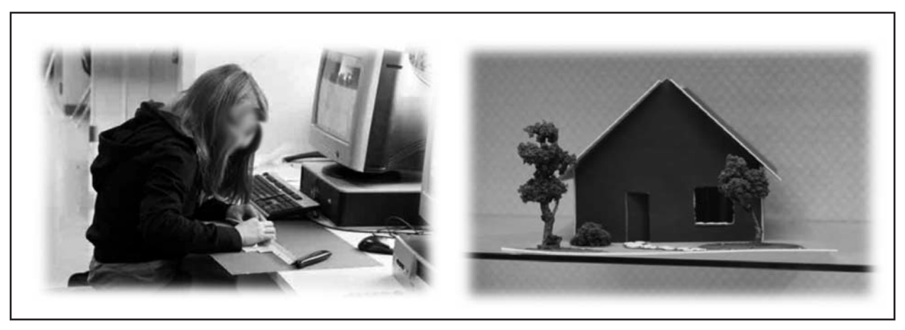
Figure 2. Activity and design artifact example in architectural design class

restrooms, and was required to be handicap accessible. Although the architecture challenge was individual, natural groupings of students formed and collaboration in terms of providing assistance to one another developed.