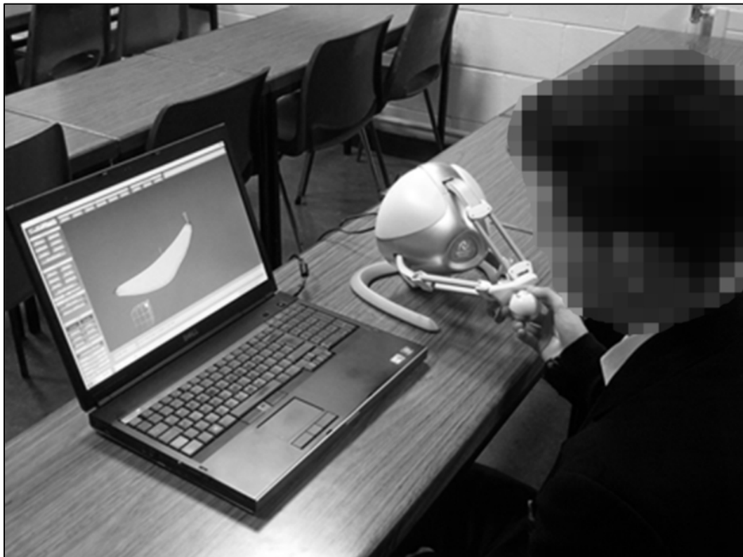
Figure 1. A participant using CRE8 and the Novint Falcon to model an organic geometry.

Parametric modelling in the form of SolidWorks was selected to be one tool the students would use to reflect their current educational curriculum. A freeform surface modelling system called CRE8 was chosen as the comparative as it is a 3D design and moulding program and therefore required a fundamentally different approach to modelling. A Novint Falcon is required in conjunction with CRE8. The device provides haptic feedback to the user allowing them to feel their model and manipulate it through touch providing an additional opposing characteristic to a parametric modelling tool. Figure 1 depicts a student using CRE8 and the Novint Falcon to model an organic geometry. When modelling with CRE8, the user first selects an initial geometry and then deforms it to create the desired geometry. Additional geometries are then created relative to this and there are no explicit dimensioning features. The non-parametric group were allocated CRE8 for this study.