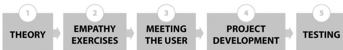
Figure 1. Course structure: From theory to prototype development.

Nineteen students (ten Brazilians and nine Norwegians) of the bachelor program in product design at UNESP and Oslo Metropolitan University (OsloMet) registered for this course. The course program was mostly practical and divided into four main blocks: (1) theoretical content on inclusive design, disabilities, and assistive and rehabilitation technologies, (2) practices of empathy development, methods of data collection, observation, and survey with people with disabilities, (3) meeting with real patients and assessment of their functional needs, preferences, and expectations, (4) project development, proposing solutions, and prototyping, and (5) prototype testing with the patients (Figure 1). The theoretical content, teaching methodology, and contact with students and professionals of occupational therapy and people with disabilities were clearly stated in the course description; thus, the enrollment in the course was by spontaneous demand. The pedagogical methods did not include critique from either peers or teachers.